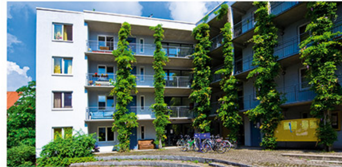
Student residence Callinstraße 25