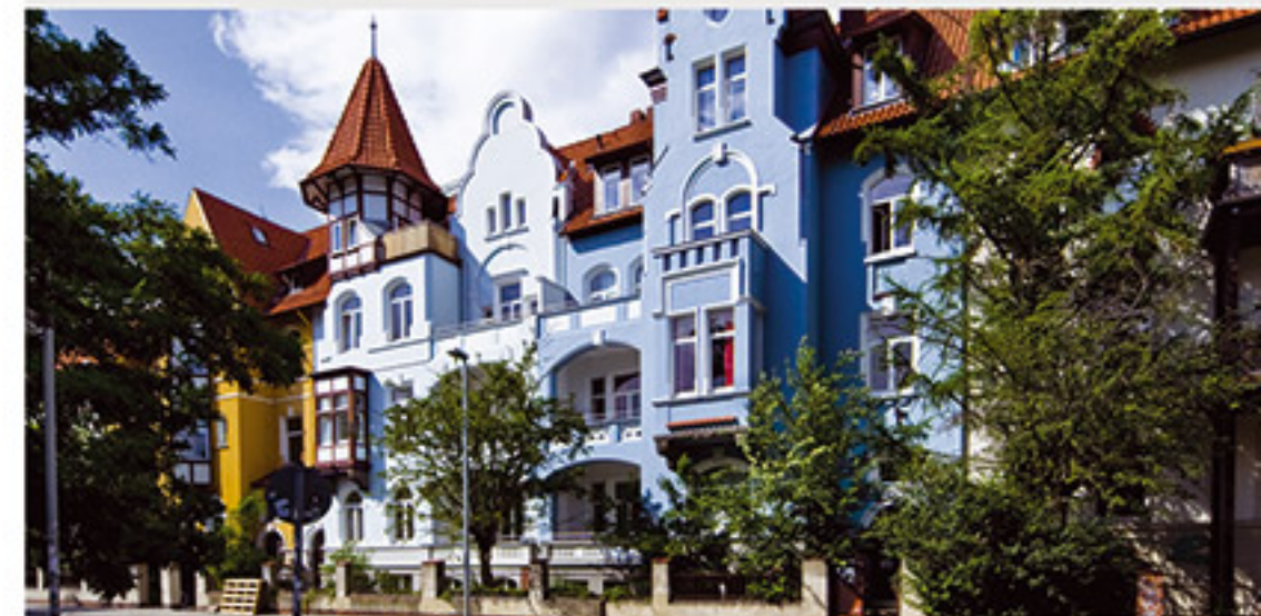
Student residence Callinstraße 18