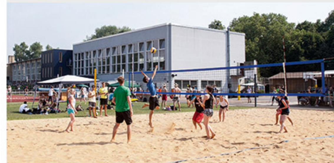
Beachvolleyball at the University Sports Centre