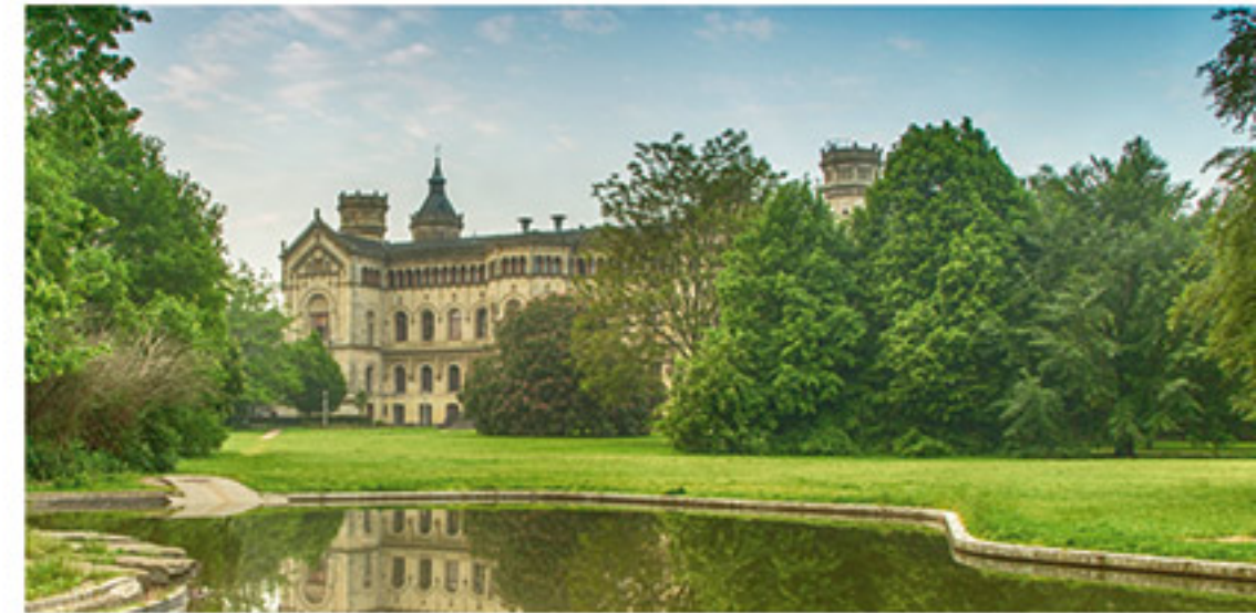
Welfengarten behind the Leibniz Universität Hannover