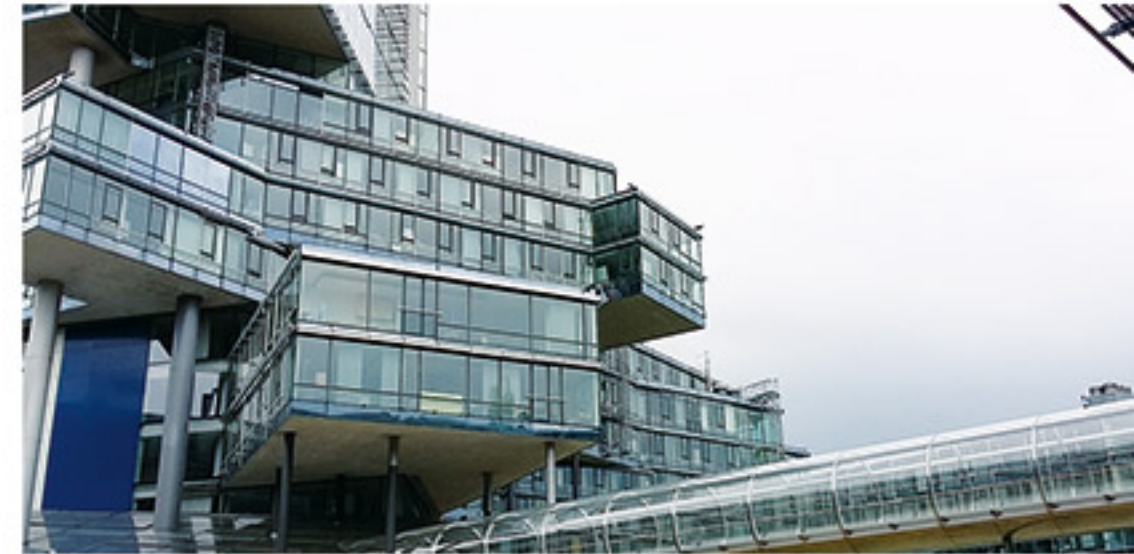
Nord/LB administration building