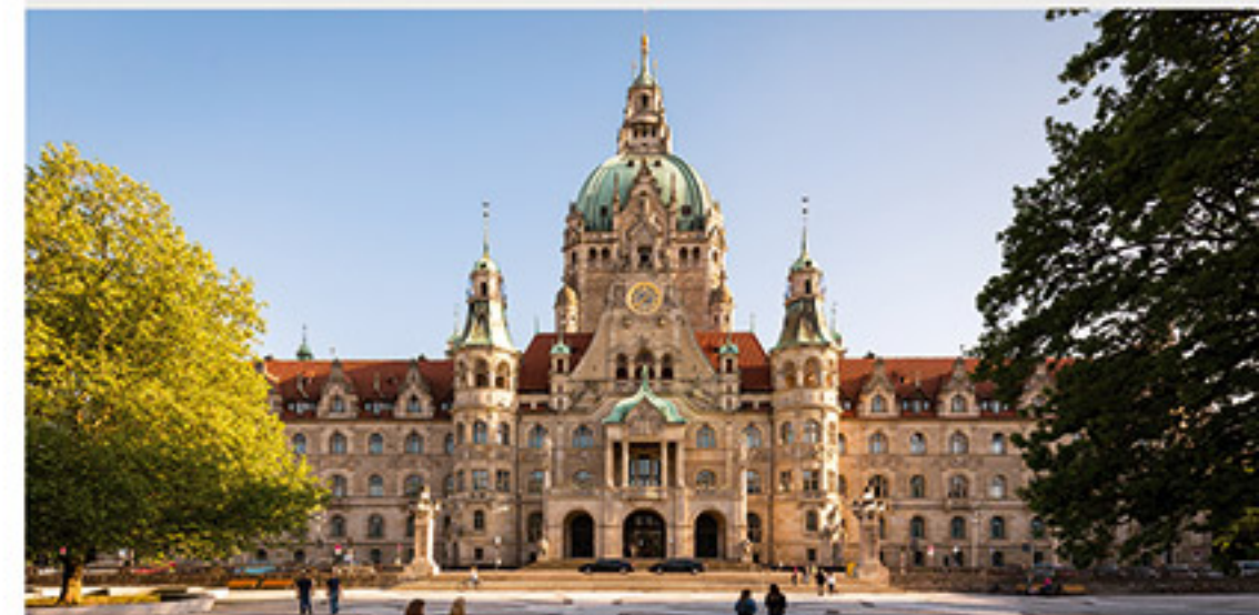
New Town Hall