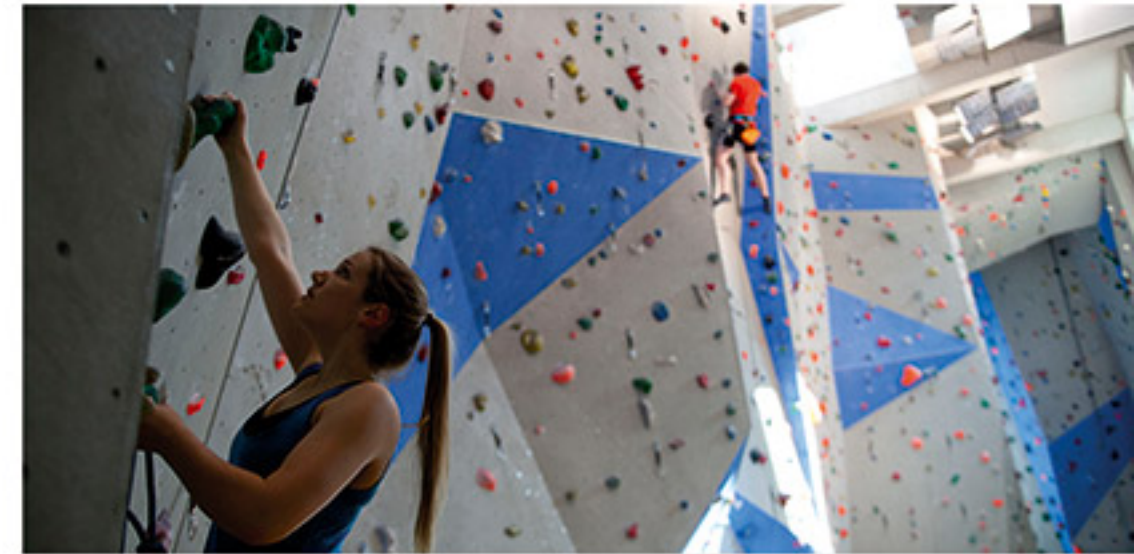
Climbing at the Climbing Hall