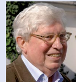
Prof. Dr. Gerhard Ertl (Nobel Prize in Chemistry, 1968-73 Professor of Physical Chemistry and Electrochemistry):

"I have many fond memories of my studies in Hannover. While I was here, the course for my professional and private life was set."